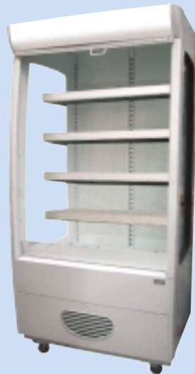
Commercial multideck units