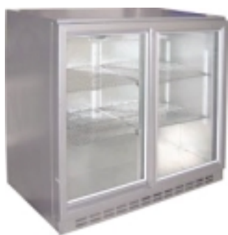
Back bar units

Contact the auctioneers for further information and web link.