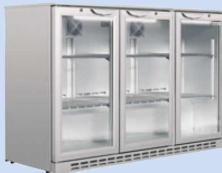
Triple/double and single back bar units

Contact the auctioneers for further information: