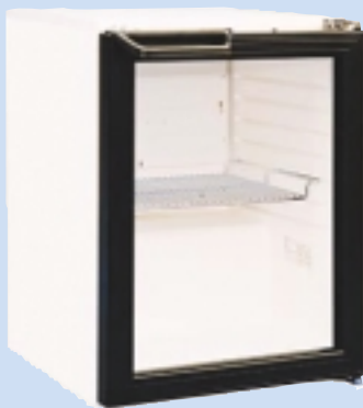
Commercial multideck units