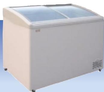
Sliding top chest freezers