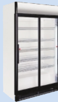
Sliding door chiller